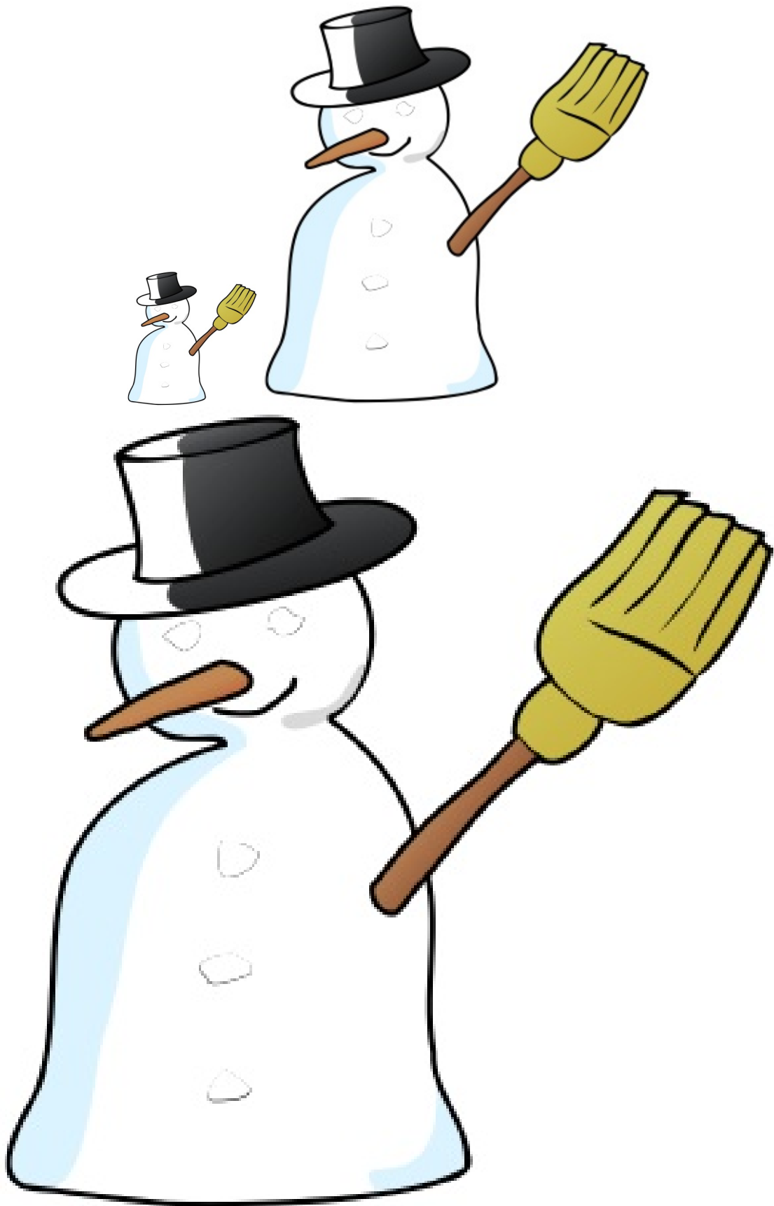
Figure 2.1: Imagem em formato bitmap (JPG)