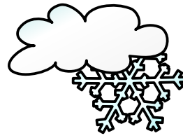
(b) Tempestade com neve