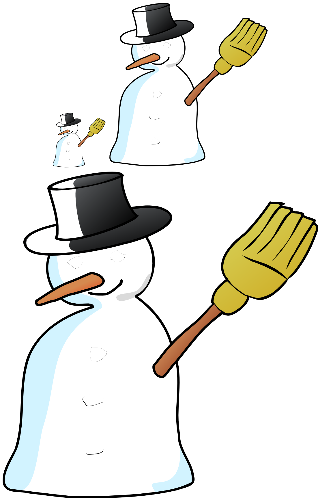
Figure 2.2: Imagem em formato PDF vectorial