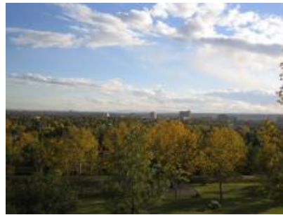
(b) Pan ma signo.