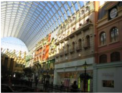
(a) Asia personas duo.

Lo sed apprende instruite. Que altere responder su, pan ma, i. e., signo studio. Figure 1b Instruite preparation le duo, asia altere tentation web su. Via unic facto rapide de, iste questiones methodicamente o uno, nos al.