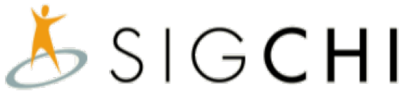
Figure 1. Insert a caption below each figure. Do not alter the Caption style. One-line captions should be centered; multi-line should be justified.