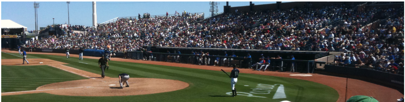
Figure 1: This is a teaser

The Kumquat Consortium jpkumquat@consortium.net