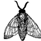
Figure 3: A sample black and white graphic that has been resized with the includegraphics command.

This sample document contains examples of .eps files to be displayable with LaTeX. If you work with pdfLaTeX, use files in the .pdf format. Note that most modern TeX systems will convert .eps to .pdf for you on the fly. More details on each of these are found in the Author's Guide .